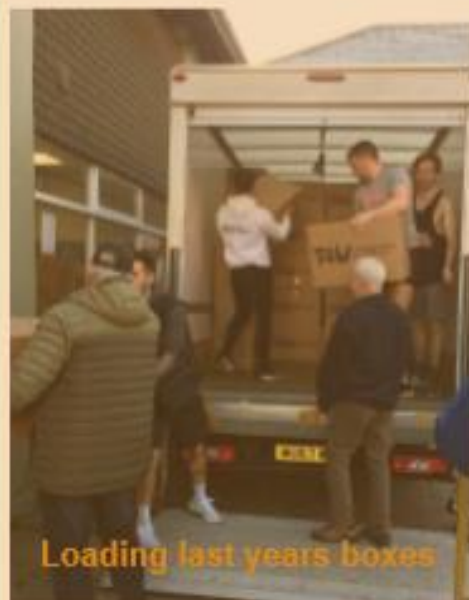
Loading last years boxes

Food (only exception is sweets), medicines, military themed items (such as toy soldiers/tanks/ guns), aerosols or anything highly flammable, sharp items, novels.